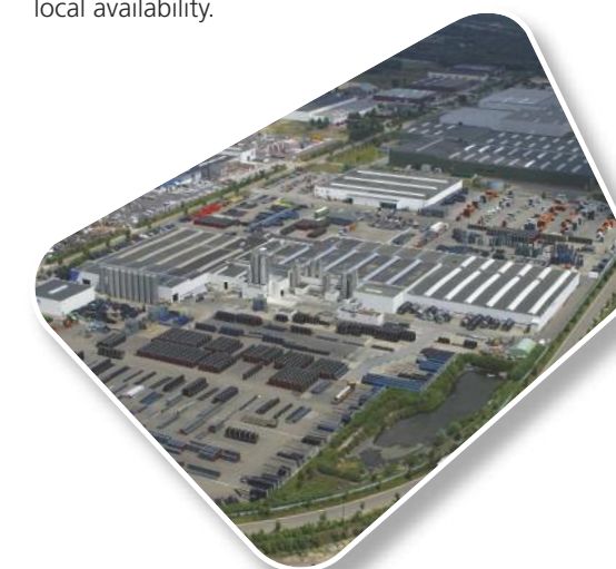
The DYKA Factory (Belgium)

JDP's reputation is built on over 40 years experience in water management. During this time, our work with our manufacturing partners has provided our customers with a total solution for their projects, combined with a national network of branches to ensure local availability.